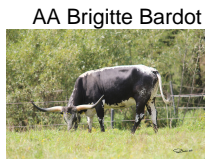
AA Brigitte Bardot