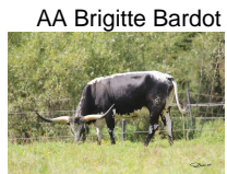
AA Brigitte Bardot