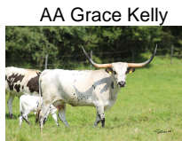
AA Grace Kelly